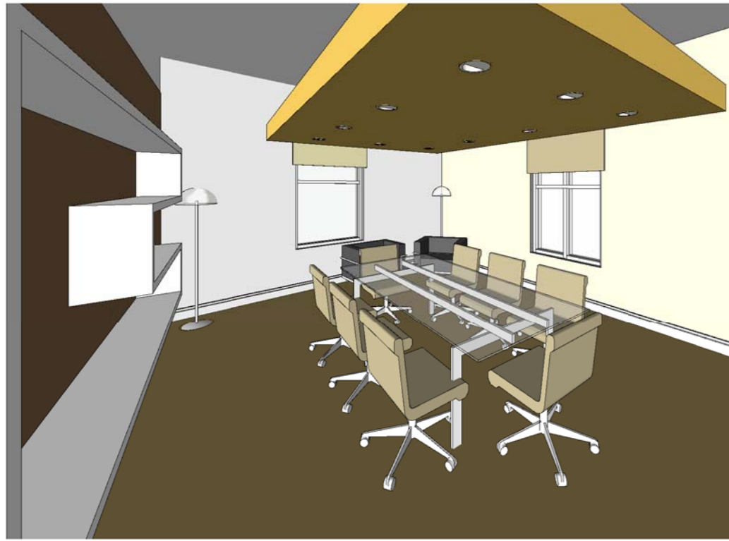
1st Floor Boardroom - 1