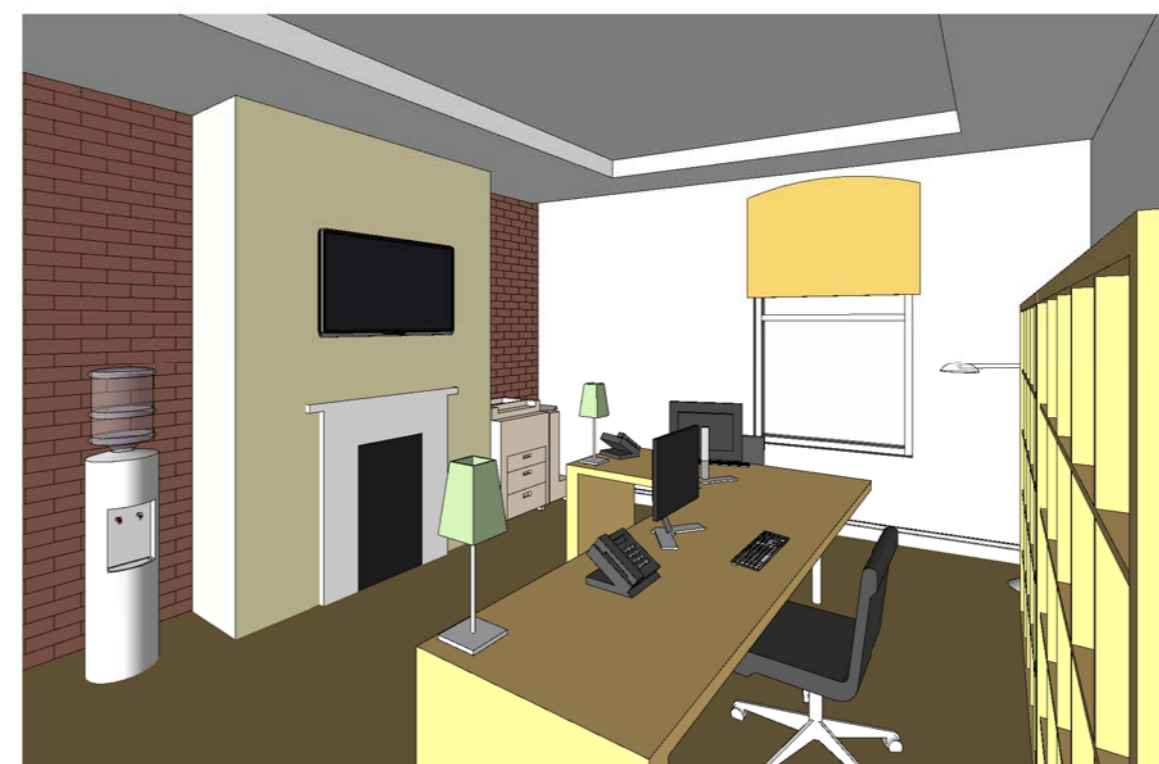
1st Floor - Large Office 3