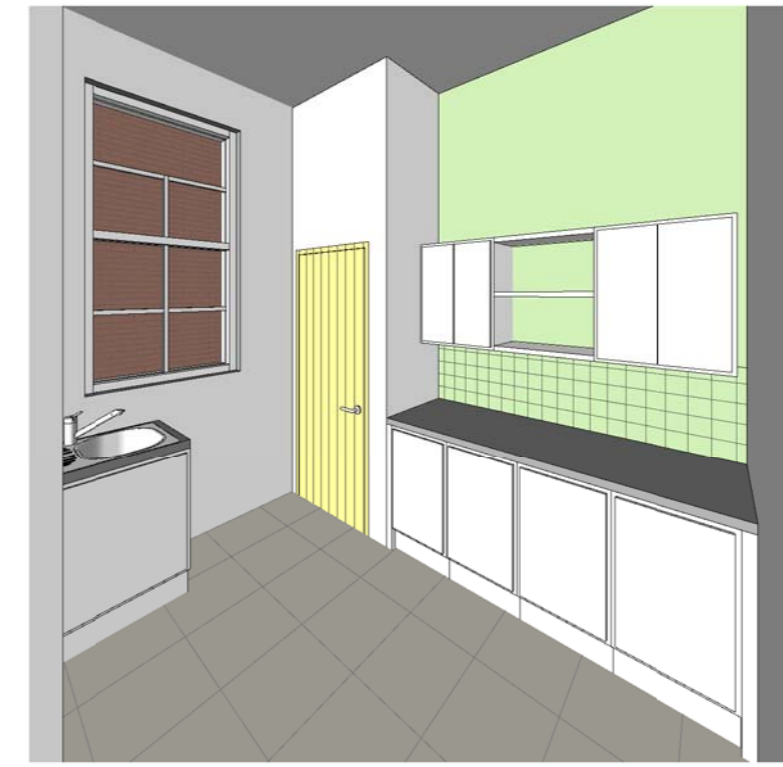
1st Floor Kitchen