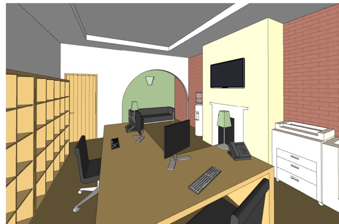
1st Floor - Large Office 2