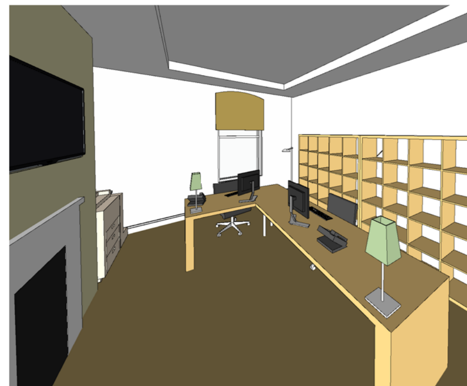
1st Floor - Large Office