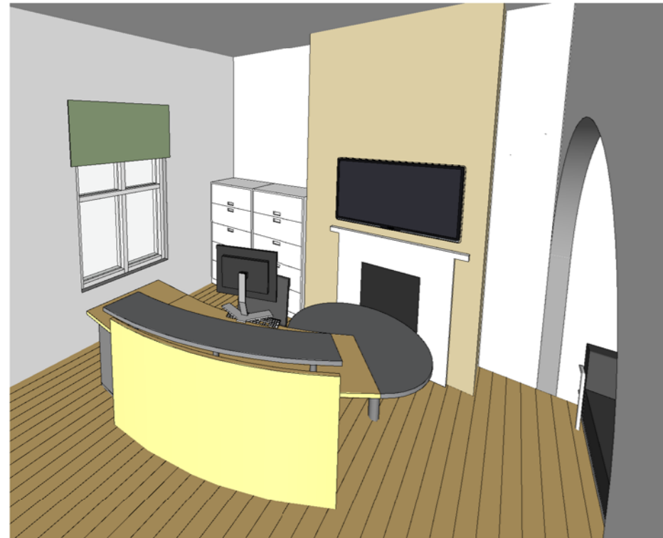
Office - 1