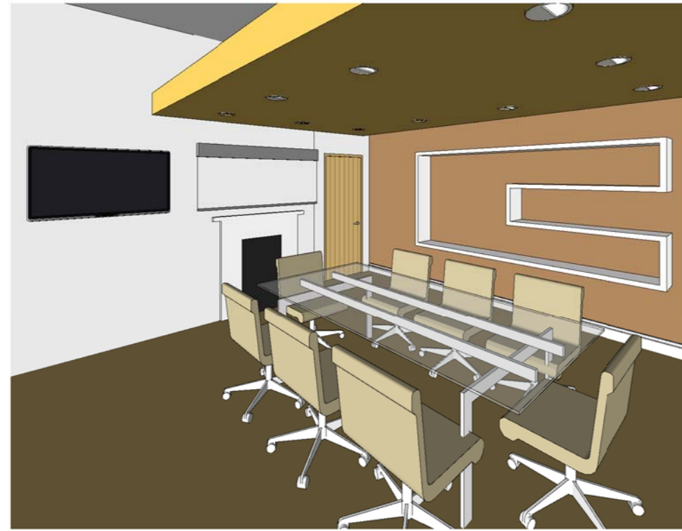
1st Floor Boardroom - 2